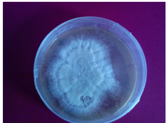
Fig. 4. Mature colony morphology on Sabouraud dextrose agar plate.

like, large, thick walled, round, dense or empty cells of between 20 and 40 μm in size (Fig. 3), with double-contoured wall. Histopathological sections of the tissue biopsy carried out on day +54 were sent for mycological re-examination and the organism appeared in tissue in double-encapsulated, empty spherical form.