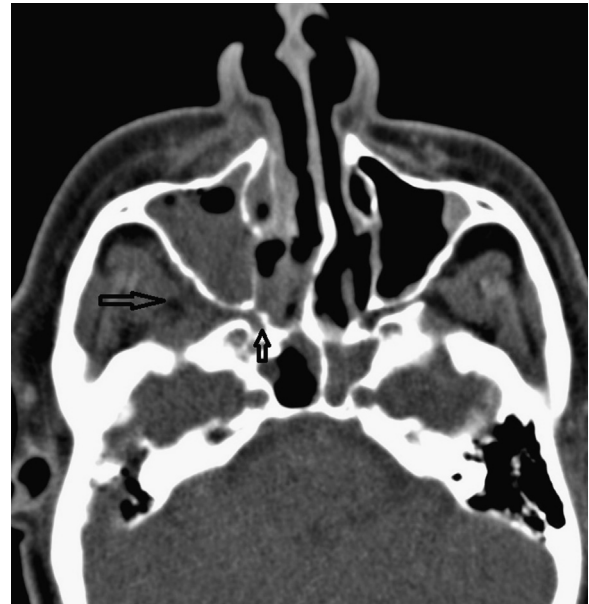
Fig. 4. Pretreatment axial CT: note spread from the nasal cavity through the sphenopalatine foramen (small arrow) involving the right pterygopalatine fossa (big arrow). There is extension of infection into the right premaxillary soft tissues.

to grow at 37 °C (but not at 45 °C) on 1% malt extract agar, and due to the production of long (> 1 mm) sporangiophores and relatively small (< 250 μm diameter) sporangia [1].