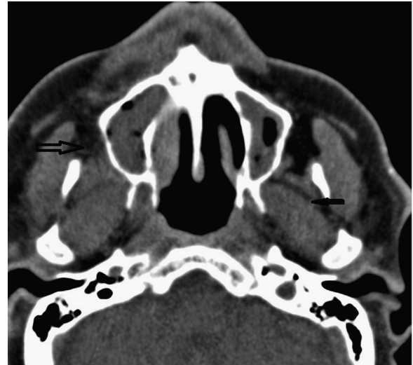
Fig. 3. Axial CT: extension of infection in the buccal space and masticator space. Hollow arrow: hyperattenuation right retromaxillary fat pad. Small arrow: thickening masticator space musculature and obliteration of the fat planes.

Rhino-orbital mucormycosis was suspected, and on day +1 an extensive unilateral endoscopic nasosinus surgery was performed, with debridement of anterior and posterior ethmoidal cells, opening of the maxillar antrum and extensive removal of invaded mucosa in the right sphenoidal sinus. Furthermore resection of the right middle turbinate and body and tail of the lower turbinate was required. Extensive fungal masses were excised from maxillary and sphenoidal sinus (disease-free in previous CT scan). Mucosa appeared necrotic and its removal was unaccompanied by bleeding. Liposomal amphotericin B (5 mg/kg) was immediately started. Rhizopus arrhizus was recovered from all plating samples on Sabouraud-cloramphenicol agar (Fig. 5). This fungus was characterized by the production of thin-walled, broad coenocytic hyphae, producing typical sporangiophores and rhizoids, being classified as pertaining to the genus Rhizopus ; and phenotypically identified as Rhizopus arrhizus , because of their capacity