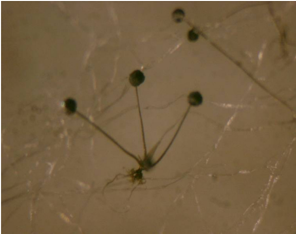
Fig. 5. Rhizopus arrhizus .