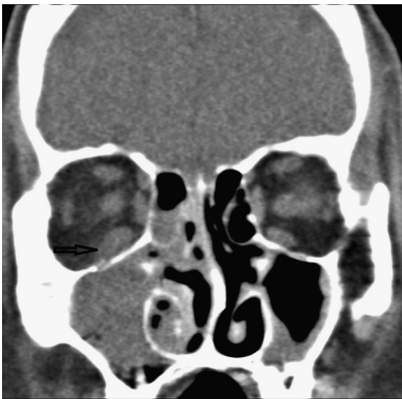
Fig. 2. Pretreatment coronal CT: right maxillary sinus opacification with intraorbital extension without bone erosion. Arrow: thickening of inferior rectus muscle and infiltration of adjacent fat.

83.7%, lymphocytes, 8.8%, monocytes 5.6%, eosinophils 0.7%, basophils 0.2%).