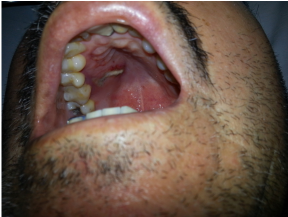
Fig. 1. Hard palate before treatment. Linear ulceration with necrotic mucosa.