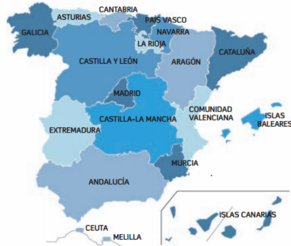
Figure 1: Spanish regions.

the services provided by the SNS are: prevention, diagnosis, treatment and rehabilitation, pharmaceutical services, orthopaedic and prosthetic services, dietary products services, non-emergency health transport. Likewise, the SNS is independently managed by the 17 regions of Spain (see Figure 1).