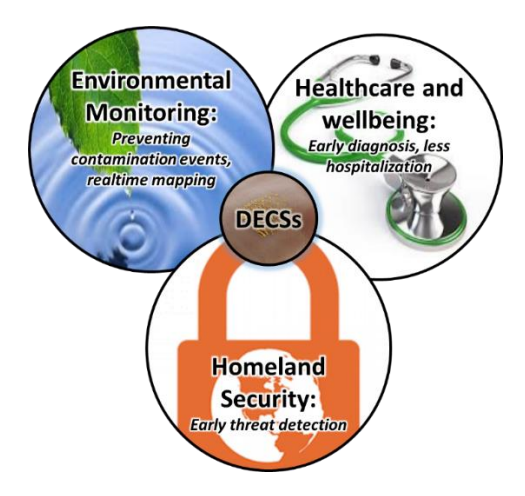
Figure 1. Major fields of application for distributed electrochemical sensors (DECSs) and they value they contribute to the field.

Indeed, building networked sensing devices that allow faster, simpler and cheaper decision-making processes has become the new paradigm for the human development in the 21<sup>st</sup> century. However, leveraging the power of the global network to reshape social systems requires that methods to generate information move from centralized models to decentralized (distributed) approaches. Scientific instruments, traditionally conceived to be produced in small scale, confined in a laboratory and operated by experts, must be now redesigned to be widely deployed, distributed across networks and used by non-experts. The challenge to build new tools that must simultaneously combine robust information, low cost, unsupervised operation (i.e. no user intervention), as well as resilience to changes in the surroundings, requires a compromise, as described by Valcárcel Cárdenas with the notion of "vanguard" analytical tools [1].