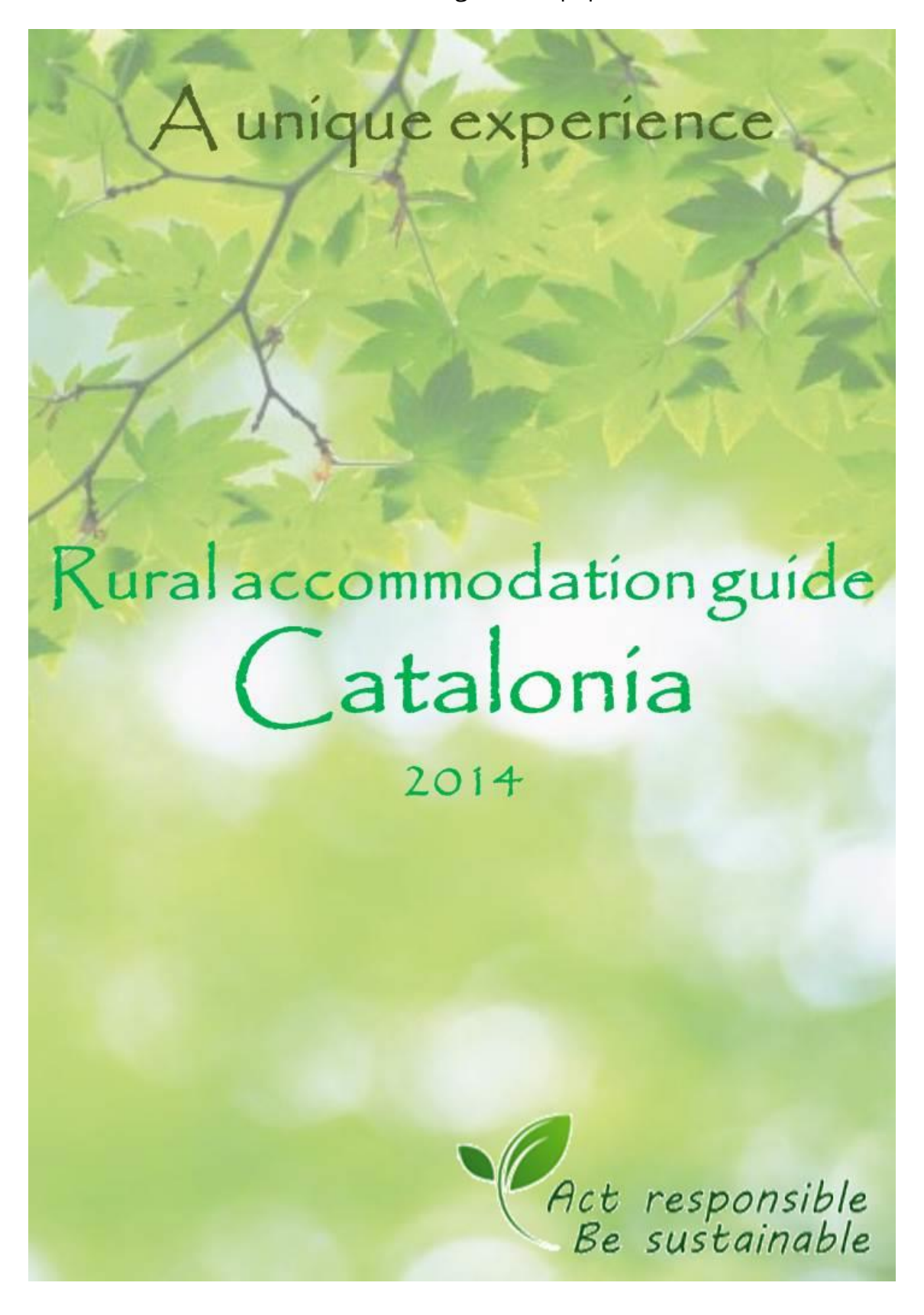
Annex V: The rural accommodation guide in paper format