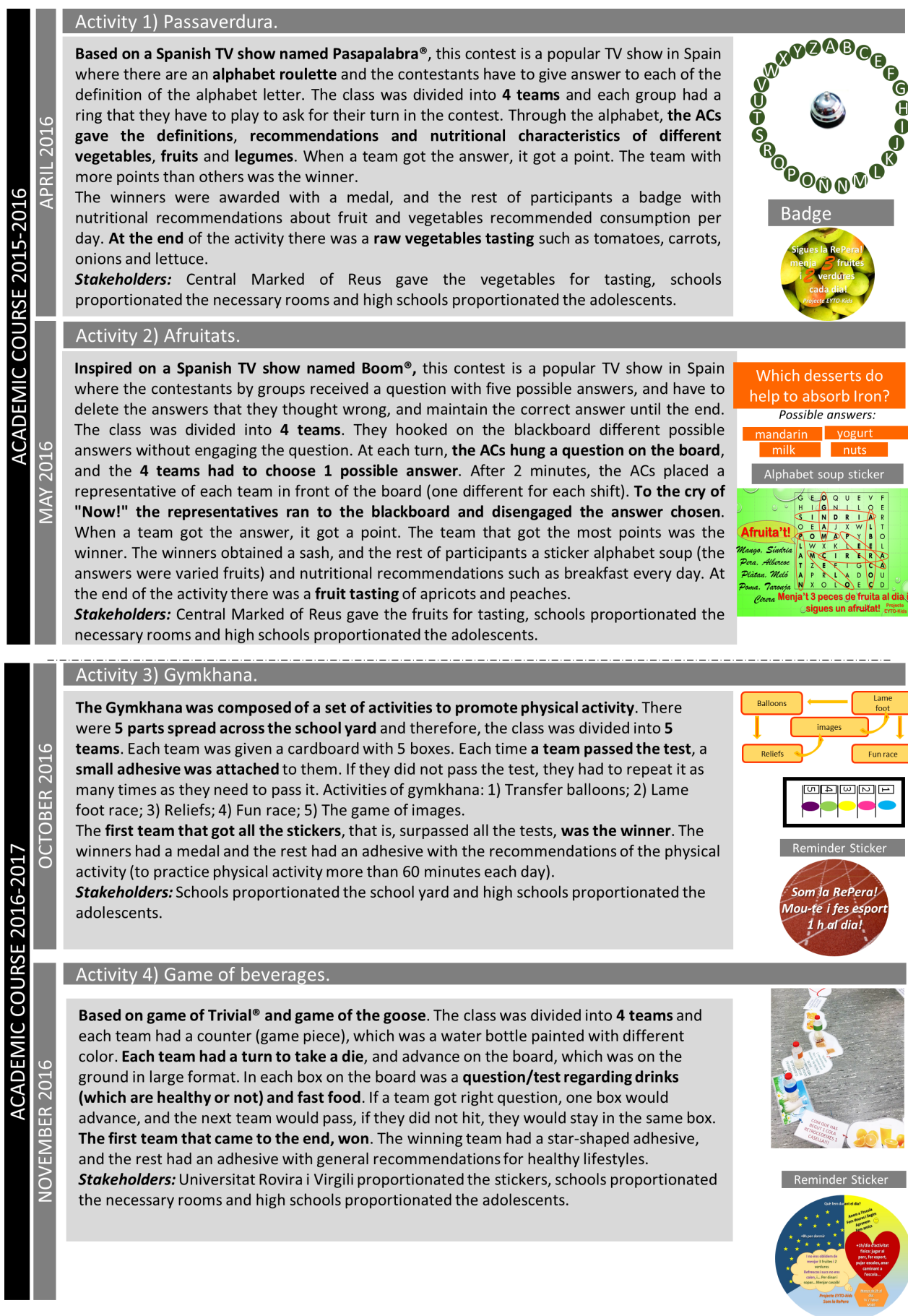
Figure 1 Activities in the European Youth Tackling Obesity-Kids project designed and implemented by adolescent creators (ACs).