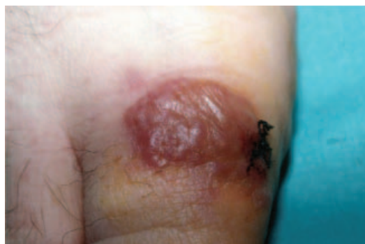
Fig. 1. Sharply demarcated granular plaque on the dorsal area of the right big toe with a vermiculate consistency.

A cutaneous biopsy was obtained. The histopathologic examination of the biopsy revealed a granulomatous dermal infiltrate and scarce stellate abscesses. The granuloma and the margins of the abscesses were composed of lymphocytes, histiocytes, epithelioid cells and multinucleated giant cells. In tissue sections stained with hematoxylin-eosin, numerous rounded, refringent, hyaline or slightly eosinophilic thick-walled fungal structures were present in the granuloma and within the giant cells. Scarce elongated budding yeast-like forms and branched septate hyphae were also present. Fungal elements were strongly stained with periodic acid-Schiff (PAS) (Fig. 2) and Grocott-Gomori methenamine-silver