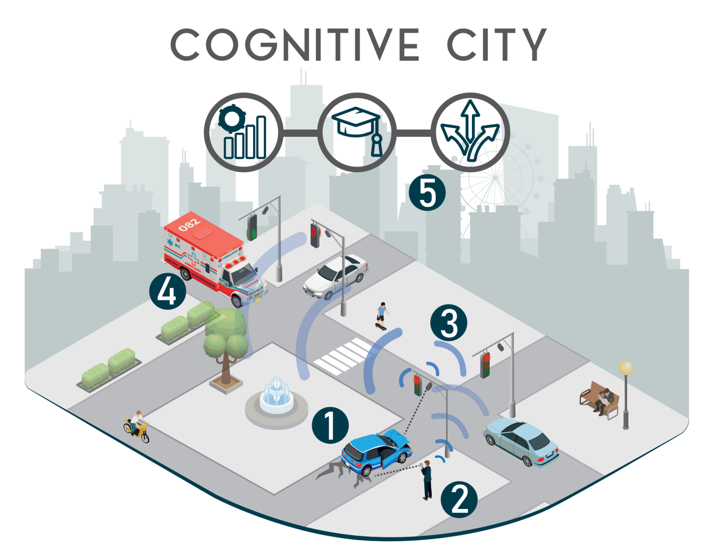
Figure 1. A cognitive city scenario.