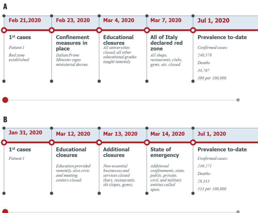
Figure 1. Italy's (Panel A) and Spain's (Panel B) response to COVID-19.

A "state of emergency" in Spain was finally declared through a royal decree (463/2020) [6] on March 14 for a period of 15 calendar days. To carry out all the measures involved, it required a high degree of coordination in all its health policies, since 17 very diverse regions were included. The "State of Emergency" was declared by the Spanish Government appealing to the unity of the Spanish state affirming the harshness and difficulty that would be required to stop the spread of COVID-19. To this end, it announced the mobilization of "all the resources" of the State, public, private, civil, and military entities. Article 116.2 of the Constitution empowered the Government to apply this measure, using a decree agreed upon by the Council of Ministers, and for a maximum period of 15 days. On March 14, all face-to-face educational activities were suspended, leaving the home was allowed only for the purchase of basic necessities and work in activities declared essential.