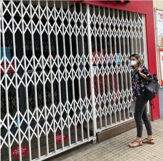
Photo: Closing of bars and restaurants in Catalonia.

of his intention to extend “the state of emergency” from April 11. An overview of the timeline of events in Spain can be found in Figure 1 , Panel B.