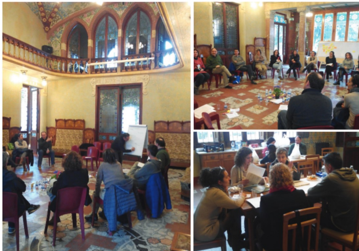
Figure 3. First Meeting of the Community of good practices on Doctoral Supervision at the Institute Pere Mata (Reus).

The meetings were organized including a social event, to strengthen the personal relationships between supervisors of the institution, followed by a short presentation on a relevant aspect of interest in supervision given by a keynote speaker. The meeting finished with some interactive activities related to practical questions in the task of supervision. Figure 3 shows different moments of one of the meetings of the community.