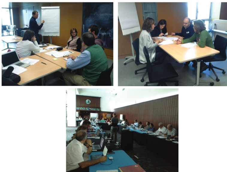
Figure 1. Collaborative work during the training courses and workshops on the Professionalization of Doctoral Supervision carried out at the URV where the classroom is organized in different ways according to the different training activities programmed.

Specifically, the training addressed to supervisors consists of an initial course on the basic topics of good practices in doctoral supervision and a group of thematic follow-up workshops, centred in other relevant subjects for the supervision not treated in the initial training course.