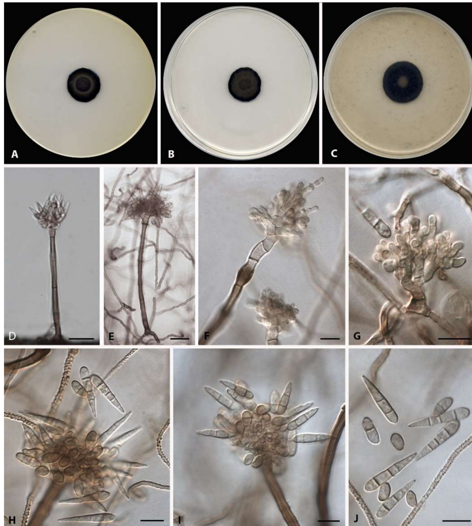
Figure 2. H. variabilis (ex-type FMR 17592). (A–C). Colonies on potato dextrose agar (PDA), potato carrot agar (PCA), and oatmeal agar (OA), respectively, after 30 days at 25 °C. (D–J). Conidiophores and conidia. Scale bars: (D,E) = 20 µm; (F–J) = 10 µm.

Heliocephala variabilis Iturrieta-González, Gené, Dania García, sp. nov.—MycoBank MB 833179 (Figure 2).