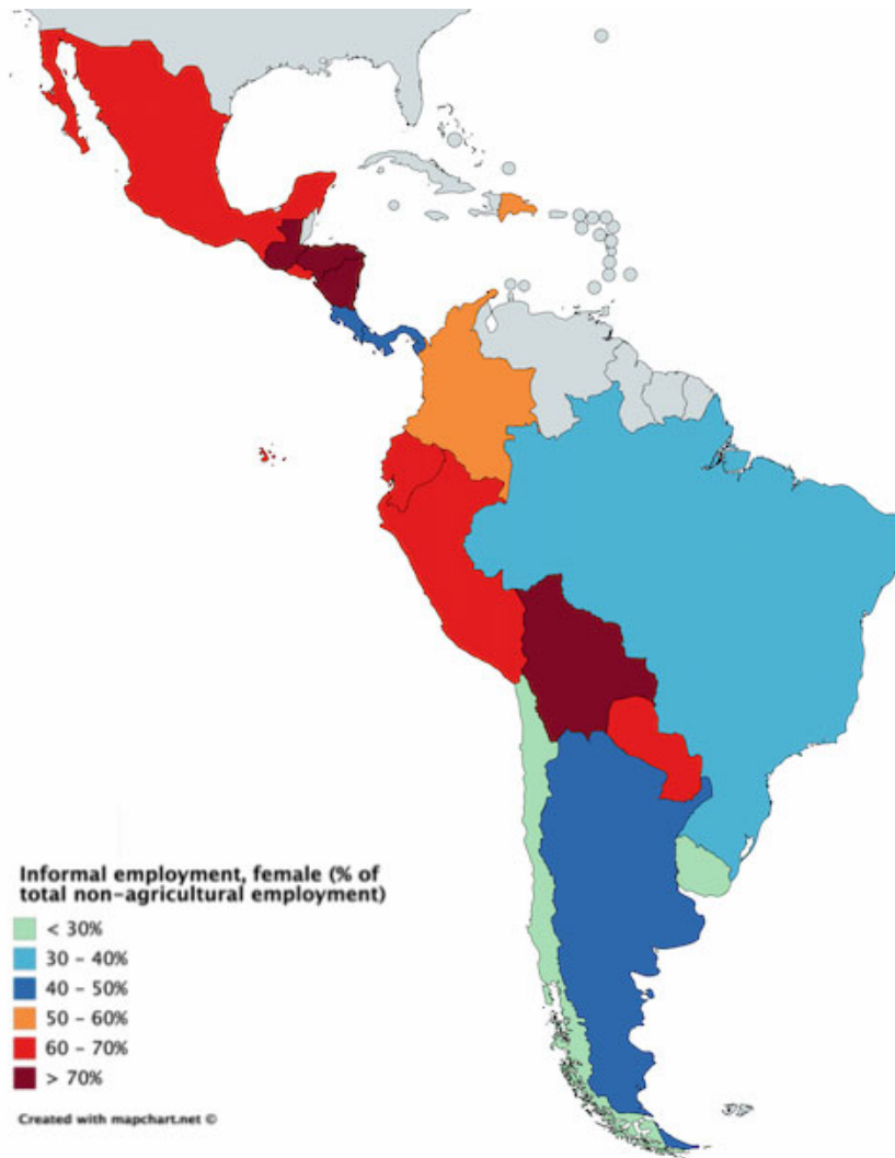
Figure 2 Share of women in informal employment, as a percentage of total non-agricultural employment, by country (see online version for colours)