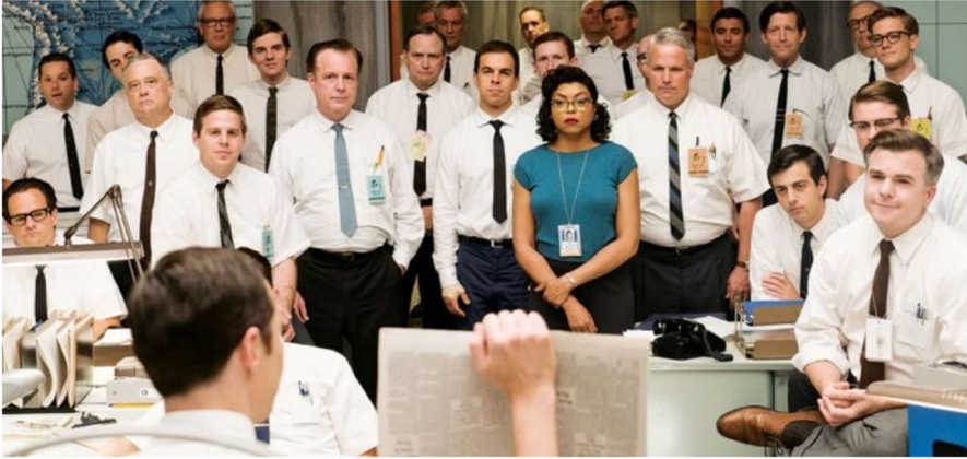
Fig. 4 Photo-narrative example of violence and discrimination. “Being an African migrant woman is not only having to face inequalities for being a woman, but also having to face discrimination, hostility and difficulties in the country where you arrive or are born. That is, being an African migrant woman is that you always have double difficulty and have to continually justify and demonstrate your reason for presence and also to break stereotypes and prejudices” (P13)

Moreover, many participants pointed out discrimination in the workplace, by both colleagues and bosses: