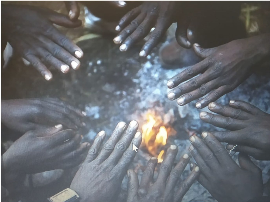
Fig. 3 Photo-narrative example of migratory projects. “We decided to emigrate because my father was already living here and his dream was that we could all be here together. I was 14 years old and right away my father called my mother and said ‘hey look, I already have the visas’. That was a Monday and on Tuesday I was already traveling. Very quickly (...) And I knew we were coming to Spain, but I had no idea where we were going. I couldn’t say goodbye to anything, I couldn’t take anything, we left our whole life there. And since then, we have been here in Spain for 16 years (...) The motivation to come was obviously to meet with my father and for the five of us to be together, and that’s how it is (P13)”