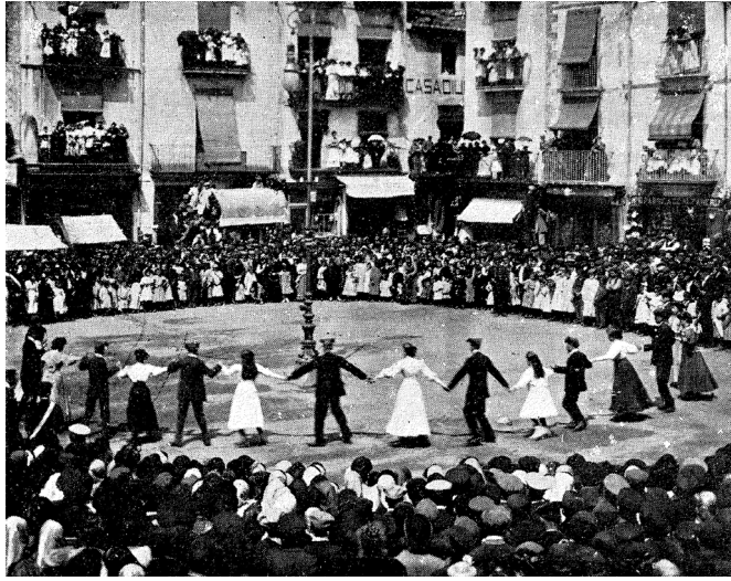
ILLUSTRATION 5. CONTRAPÀS LLARG, CONTRAPASSAIRES OF OLOT (c. 1908).