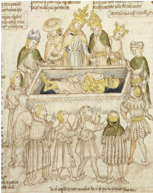
ILLUSTRATION 3. ENCIRCLING THE DECEASED, MANUSCRIPT COD. CAS. 1404, SHEET 5. BIBLIOTECA CASANATENSE, ROME.