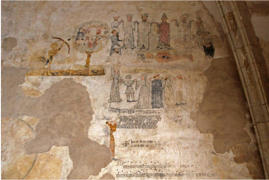
ILLUSTRATION 2. DANCE AROUND THE BODY. FRESCO IN THE SALA DE PROFUNDIS IN THE CONVENT OF SANT FRANCESC IN MORELLA (C. 1470).

published 1990 did not include any of these details, the new extended 2017 edition incorporated them, profitably, as if they were of her own. 31