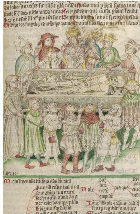
ILLUSTRATION 4. ENCIRCLING THE DECEASED, APOCALYPSE MS. 49, FOL. 31. WELCOMELIBRARY, LONDON.

group in their second DVD of the Morescarole group have “reconstructed” it on their second DVD of La Danse Médiévale . 33