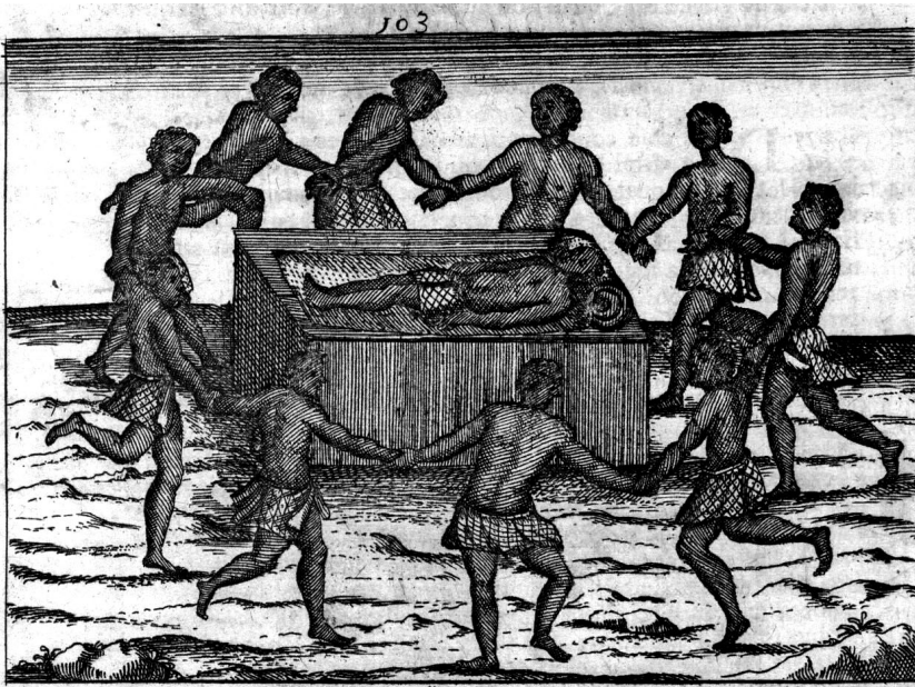
ILLUSTRATION 1. FUNERAL DANCE FROM THE CONGO, ENGRAVING FROM THE CAVAZZI DA MONTECUCCULO, ISTORICA DESCRIZIONE DEI TRE REGNI CONGO, MATAMBA ED ANGOLA OF FEDERICO AGNELLI. BNF GALICA VUE 19: [PL. IN REG. P. 103: DANSE FUNÉRAIRE AU CONGO.] [COTE: RÉSERVE DT 350.5 C 37].

later, the slow dance that the women of Martano (Lecce) did in a circle with white handkerchiefs held by the ends, danced around the body, moving rhythmically as they did little jumps. This appears in the film Stendali (suonano ancora) (1959) by Cecilia Mangini, a documentary about funeral rituals in Puglia, last testimony of a funeral lamentation in Greek ( griko ), of high ethnographic value endorsed by the studies by Ernesto Martino. 26 The Jewish ceremony of the hacafot haniftar should also be remembered. This consists of encircling the deceased seven times during the burial in the cemetery, “coming and going as if they were dancing”, as a way to keep dangerous spirits at bay. 27 In other cultures, formally similar rituals are observed in which the deceased, in the centre, is surrounded by a dance with men