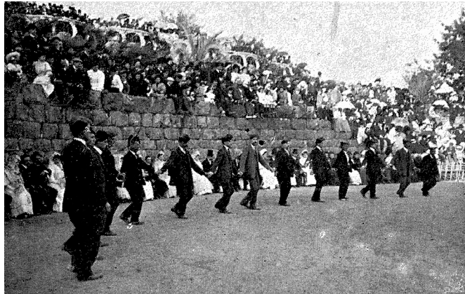
ILLUSTRATION 6. CONTRAPÀS LLARG IN THE PARC GÜELL IN BARCELONA, CONTRAPASSAIRES BANYOLES (1908).

necessary precision, to conclude exactly on the point where they had started, that is, in front of the musicians. 60 The venue had to be, of course, the square, and