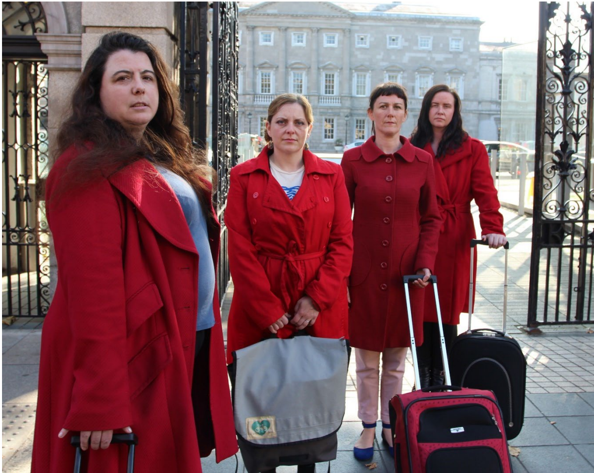
Figure 1. “Metronome”