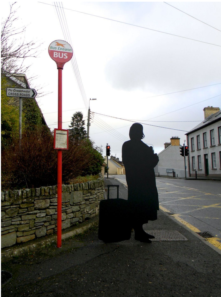
Figure 2. Out of the shadows

Source: https://willstleger.wordpress.com/2017/01/03/out-of-the-shadows/ Credit: Will St Leger, permission to use granted by the artist